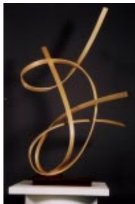
Leonard Harris Four Winds 23 1/4" x 13 1/2" x 8 1/2"